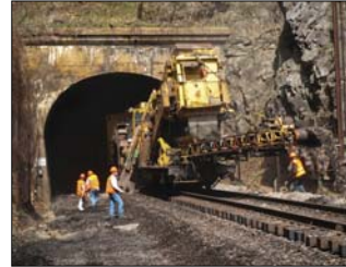
Lowering track at Eggleston Tunnel in Virginia