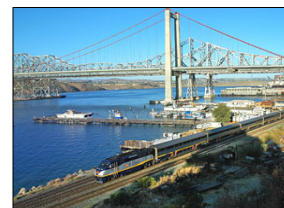
Amtrak train on Capitol Corridor at Crockett, CA